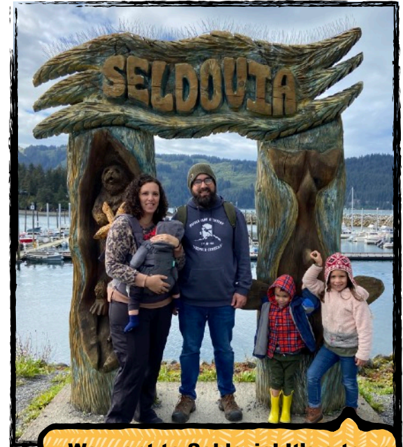
We went to Seldovia! It's a town accessible only by boat or plane.

We also visited Kingdom Air Corps which is in Sutton, Alaska, about four hours north of where we're staying. KAC does bush pilot training and hosts Bible camps in the interior. We wanted to build relationships with several people: A fellow Samaritan Aviation family training there and two MMS graduates serving there. During the trip we met another family who is in application with Samaritan Aviation. We really hit it off