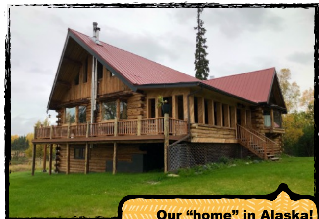
Our "home" in Alaska!