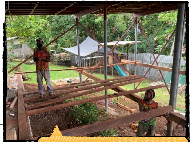
Our apartment in its current state.