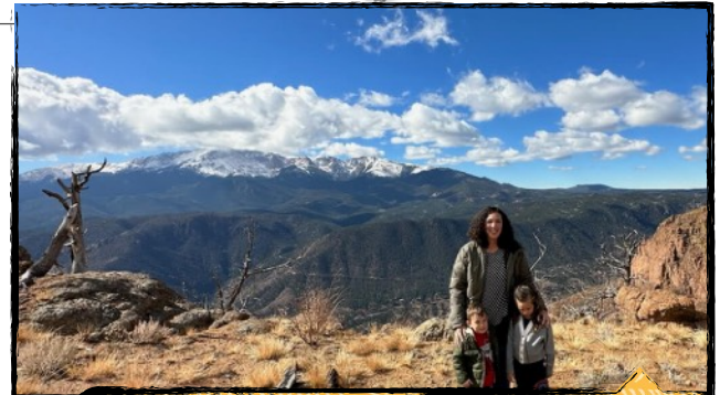
Here we're at 7,000 feet with Pikes Peak in the background ( which is 7,000 feet higher).

We came home from Alaska on October 1, mowed the yard, fixed a few things on the van, packed, and left for Mission Training International (MTI) in Colorado on October 17. Along the way we stopped at a few interesting tourist traps, such the world's largest mailbox. We even added more twine to the world's largest ball of twine, which some family members claimed wasn't very interesting.