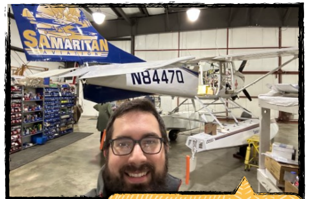
Working on the floatplane in the hangar at MMS Aviation.

While not moving until March is a Yuck Duck, staying here at MMS Aviation and working on Samaritan Aviation's floatplane is a Yay Duck! The floatplane is getting several radio and instrument upgrades. Then it has to pass an inspection by the FAA to get exported. After that, it gets disassembled and fitted into a 40 foot shipping container. And yes, we will be allowed to put some of our stuff into the container! The neat thing is that I'll be saying hello again to the airplane when it gets to the other side of the world where I'll help put it together again. I'm trying to pay close attention!